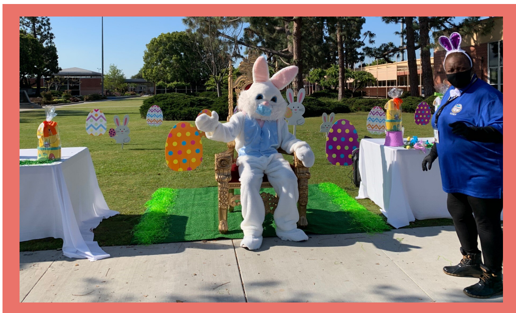
The Easter Bunny greeting residents during the "Hop Up" Drive-Thru at City Hall

**Please note that the grocery stores may change or discontinue the hours of operation listed here.