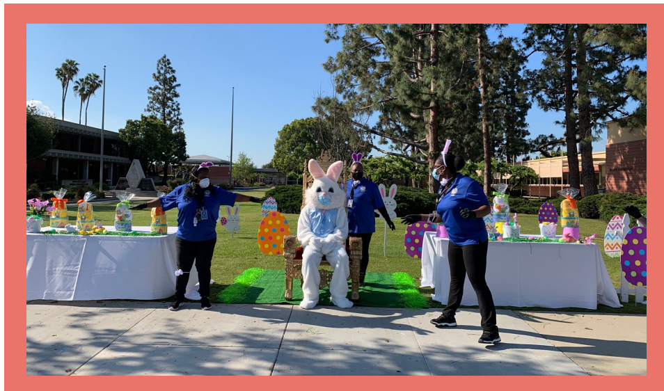
Easter Bunny "Hop Up" Drive-Thru at Gardena City Hall