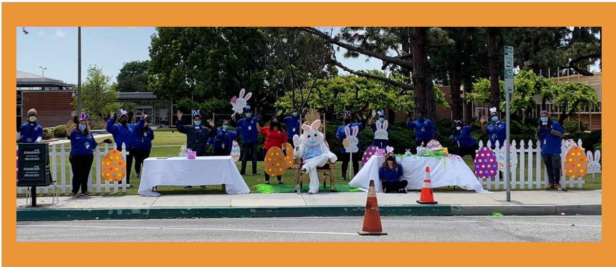
The Easter Bunny and Staff greeting residents during the "Hop Up" Drive-Thru at City Hall

Please continue to do your part to flatten the curve and refrain from in-person gatherings and practice physical distancing.